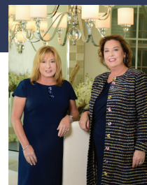
The Redpath Team

Allie Beth Allman & Associates A BERKSHIRE HATHAWAY AFFILIATE