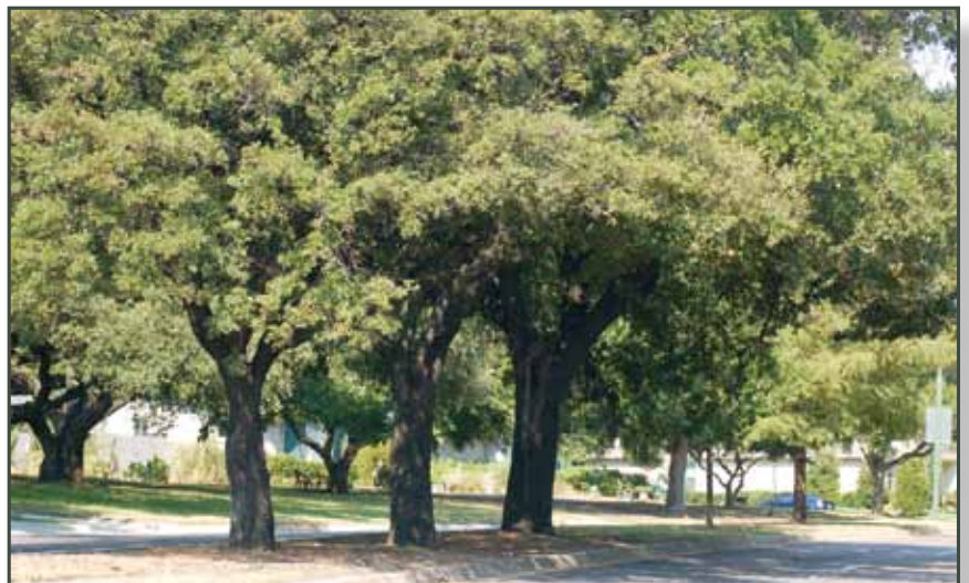
Many trees along Spring Valley hang over into traffic lanes.