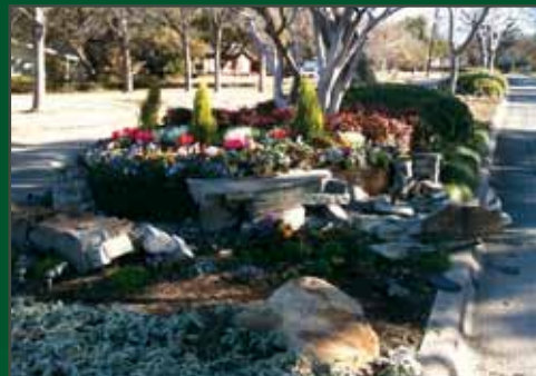
Elmridge at Hillcrest

As for the condition of the cars that hit these substantial stone installations...the walls aren't talking..