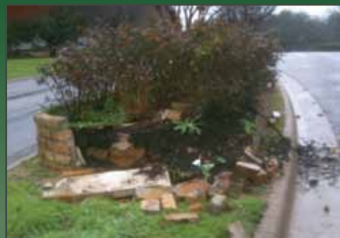
Spring Valley at Hillcrest