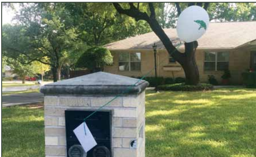
Special sentiments for those recognized on Good Neighbor Day.