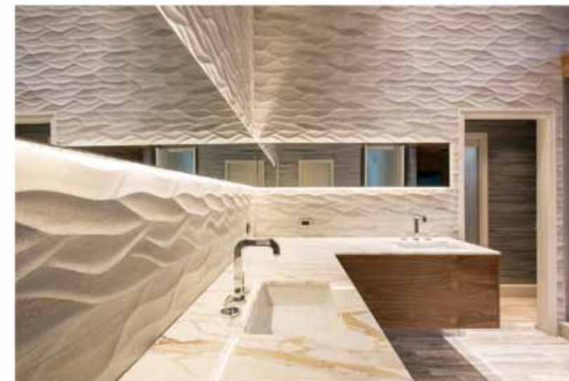
Another beautiful project in Northwood Hills

Innovative, Reliable, Quality Remodeling