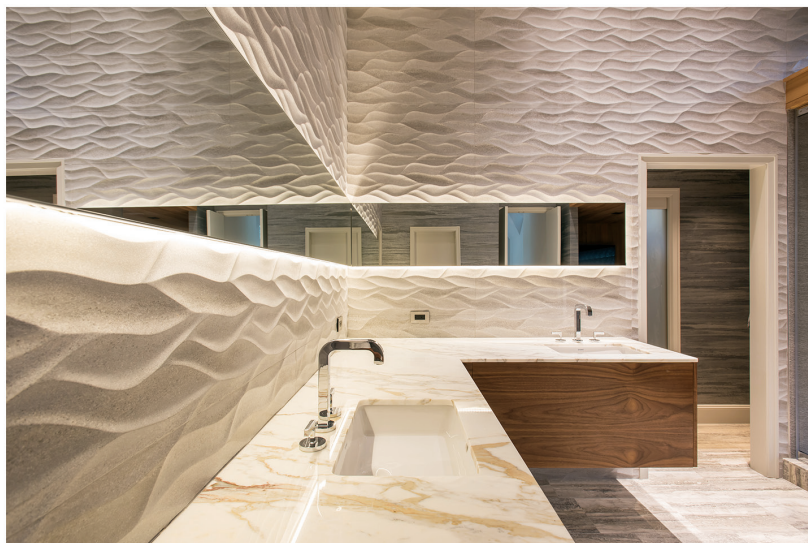
Another beautiful project in Northwood Hills

pick up school supplies and spirit wear and sign up for volunteer opportunities! Also watch the New Falcons website and e-news this summer for the date and time for "Popsicles on the Playground", a time for incoming Kindergarten students to play together and for parents to meet the Kinder teaching team.