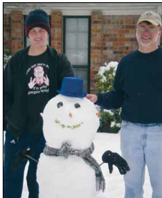
Northwood Hills' population increased for several days in early February, when six inches of snow gave birth to dozens of snowmen in the neighborhood.