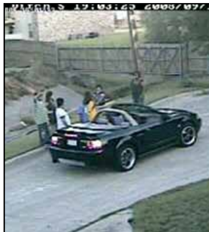
Sample camera view.

City-approved signs have been installed in key locations, often replacing old and faded Crimewatch signs. Individual property owners have the option of installing signs on their property (on alley fences, for example) advising of the camera use. To inquire about a sign for your property, contact NHHA Board members David Abell at da@northwoodhills.org or Ed Fikse at ef@northwoodhills.org .