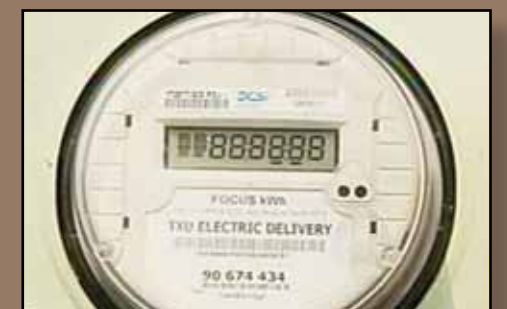
Updated smart meter