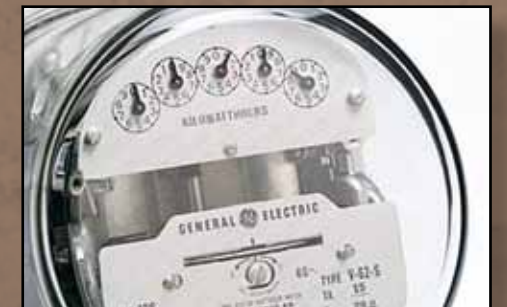
Traditional analog meter.

To learn how to monitor and manage your electricity usage with the new smart meters, go to www.smartmetertexas.com .