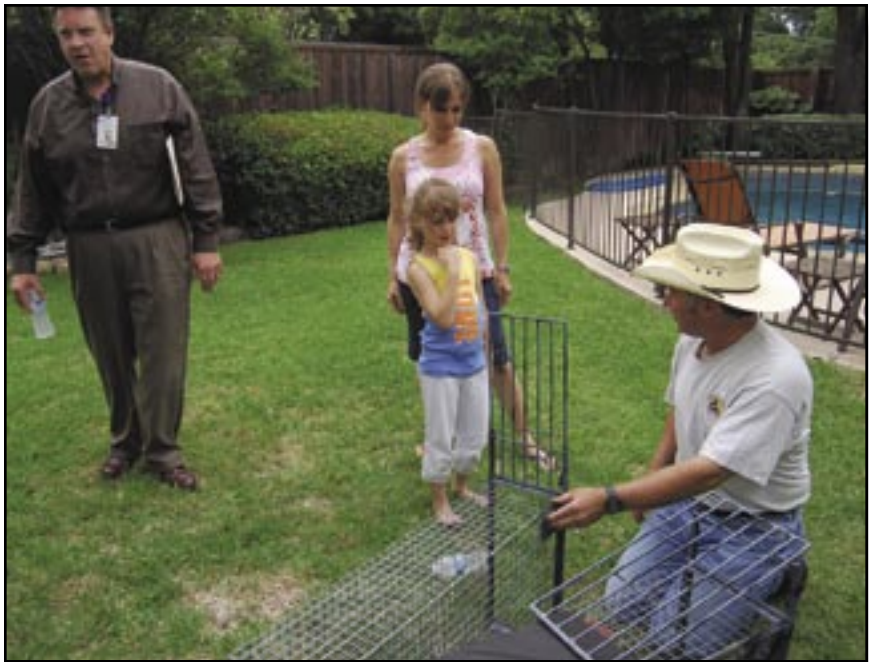
Red fox sightings are fairly common in Northwood Hills, but when the animals take up residence to raise their young they can be more problematic than interesting.

No names will be used. Email rw@northwoodhills.org to submit photos in jpg format. NHHA can also borrow black and white or color prints, scan them for use, then return them.