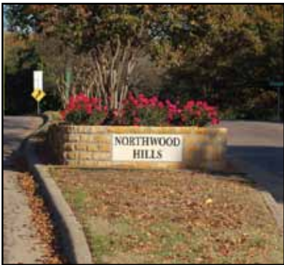
That's more like it!