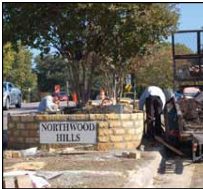
The hardscape is complete.