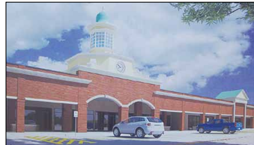
Brick facades and a clock tower will enhance the new look of Spring Creek Village at the northwest corner of Belt Line and Coit Road.

Interest rates are headed up...it is only a matter of time. Meanwhile, buyers continue to be attracted to Northwood Hills. Let's keep it that way! For more information, contact Judy Switzer at 214-801-7273 (cell).