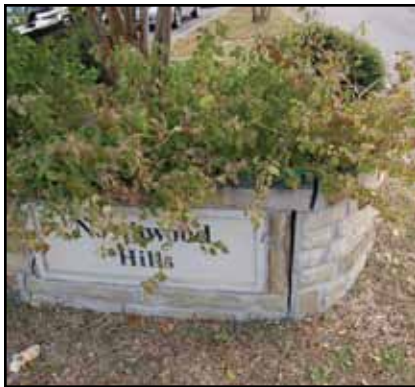
Not chic, just shabby.

The Northwood Hills median on Spring Valley just east of Hillcrest recently received a facelift. Old, overgrown plantings were dug out to make room for the Knock-Out® roses that are a hallmark of the other entrances. The crumbling marker and retaining walls were completely rebuilt, and the entire planting bed was expanded to allow for more color and a better environment for the big crepe myrtle. A border of decomposed granite makes for easier maintenance.