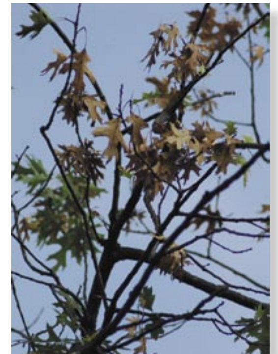
This red oak on Meadowcreek has succumbed to oak wilt.