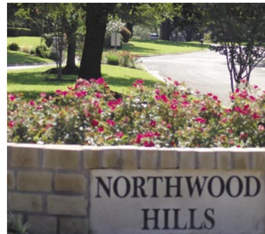
...is now branded and beautiful.