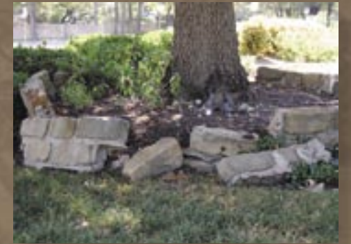
The dirt packed around the live oaks harbored large fire ant mounds.