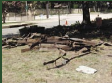
The median was sectioned into multiple areas of turf and ground cover around the walls, requiring extensive edging and trimming. The new simpler design makes maintenance much easier (thus less expensive.)