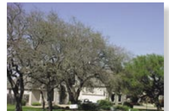
Oak wilt can wipe out entire blocks of trees, completely changing the look of yards in the neighborhood.