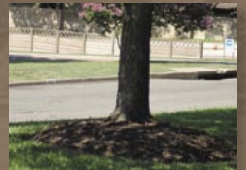
New soil and compost are at the appropriate level around the big trees.