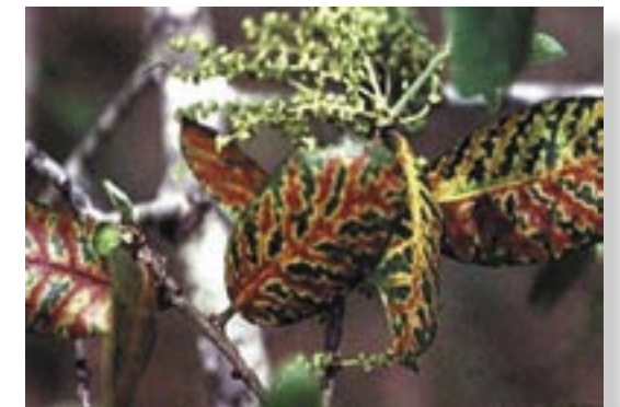
Live oak leaves showing oak wilt symptoms