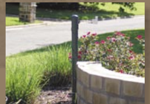
The median now has a rain/freeze sensor, which brings us into compliance with Dallas city code and minimizes waste.