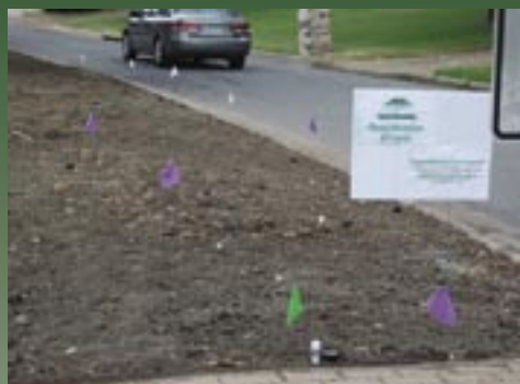
A completely new irrigation system goes in, incorporating the latest technology in water-efficiency.