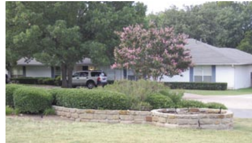
What used to be a lackluster entrance...

We're nearly to the end of the big overhaul of our medians, but natural spaces and plants evolve. There will always be a need and opportunity for member volunteers to help with the maintenance of our medians, and to provide guidance and information to homeowners. You don't need a degree in horticulture...just a passion for plants. Email rw@northwoodhills.org to be part of the next generation of caretakers for our green spaces.